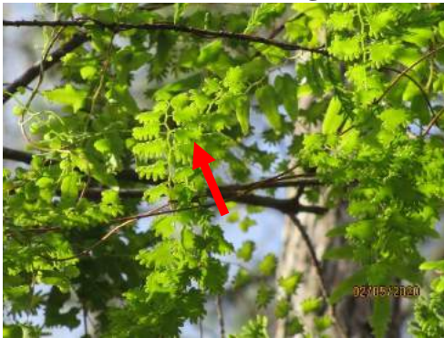
Old World Climbing Fern