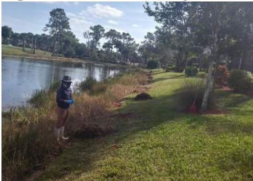
Spike Rush Removal along Lake 40